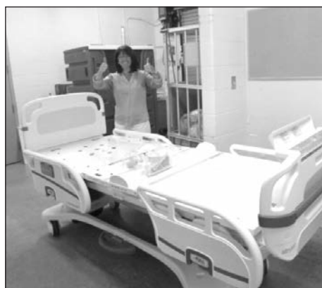
Fully assembled and ready to go!

Generous community support to the Light up a Life Campaign made this possible. Thank you!!