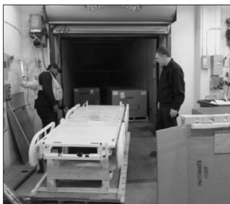
The process of unloading the beds begins.

15 new electric beds were delivered to NHH in March and we were there to take photos!